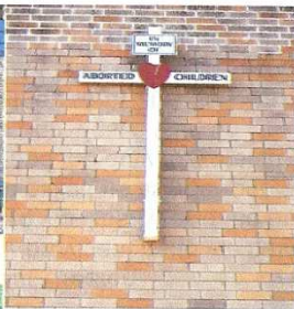
St. Bridget Hobart, Ind.