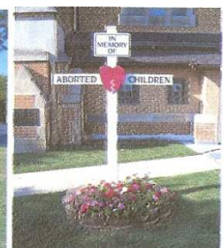
St Joseph the Worker Gary, Ind.