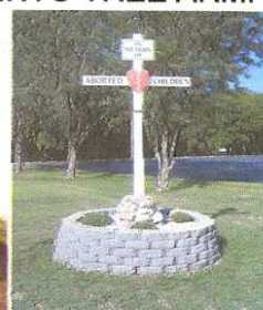
St Joan Of Arc Merrillville, Ind.