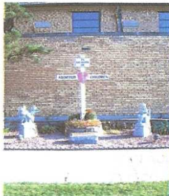
Our Lady of Sorrows Valparaiso, Ind.

MATERIAL SUPPLIED BY INSTALLER: ONE 4" SQUARE TREATED POST, 4 FEET LONG. SHIMS TO FIT INTO TREE ARM.