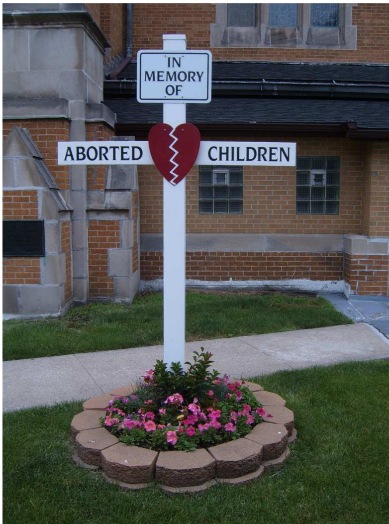
This Memorial Cross is located at St Joseph The worker Church, Gary.

The cross is a project of Knights of Columbus Council 7541 from Goshen. They cost $135 each for a one-sided cross and $185 for a two-sided cross.