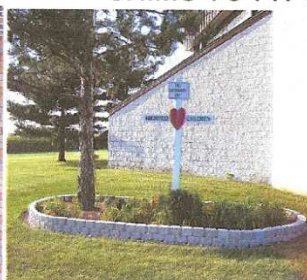
St. Elizabeth Ann Seton Lake Eliza, Ind.